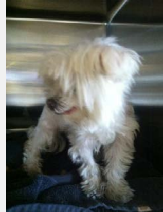
Cupcake – old, used up and dumped at the shelter

And the good news! When Cupcake got her stitches out she was groomed. The change in her rocks my world. I can already see a huge transformation in her and a joy and spirit to love her fosters and a renewed interest in food. She is well on her way to being pain free. Rescuing animals rescues the human spirit. I believe that. Go Cupcake!