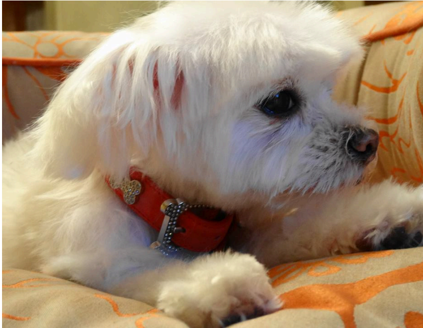
Cupcake is now recovering from multiple surgeries and is almost pain free!