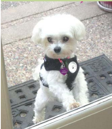
Cindy the Therapy Dog (formerly Cinderella)